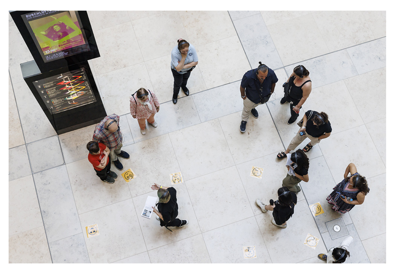
" <u>Pigeons, Strawberries, Dilemma - Interesting Sound Guide</u> " performance scene.